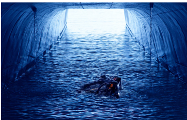
Regular cable 100-400 m