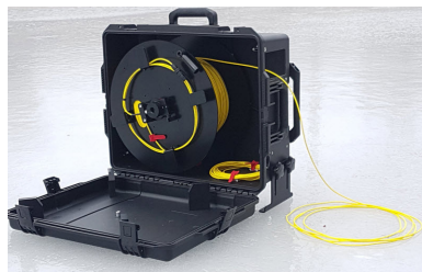
Manual drum in bag