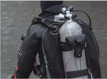
Diver modem unit