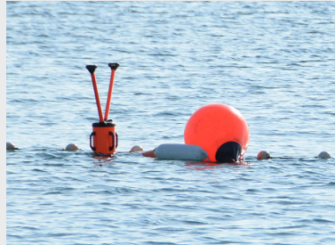
Communication and positioning buoy